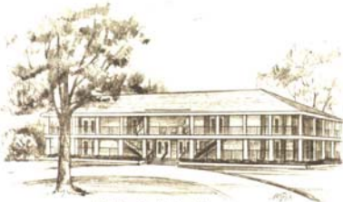
St. Elizabeth Ann Seton Shreveport, Louisiana