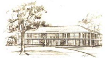
St. Elizabeth Ann Seton Shreveport, Louisiana

St. Elizabeth Ann Seton Roman Catholic Church 522 East Flournoy Lucas Road Shreveport, Louisiana 71115 (318) 798-1887