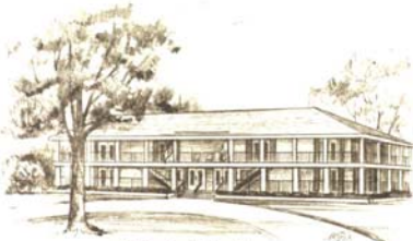
St. Elizabeth Ann Seton Shreveport, Louisiana