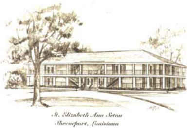
St. Elizabeth Ann Seton Shreveport, Louisiana