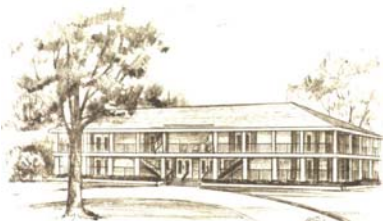
St. Elizabeth Ann Seton Shreveport, Louisiana