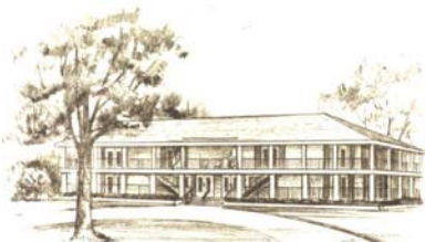
St. Elizabeth Ann Seton Shreveport, Louisiana