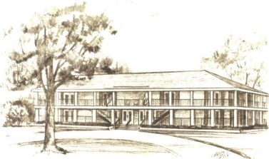
St. Elizabeth Ann Seton Shreveport, Louisiana