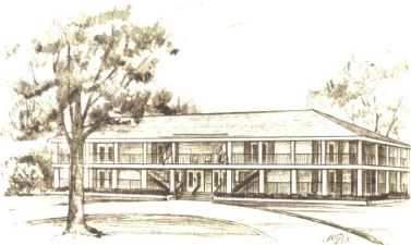
St. Elizabeth Ann Seton Shreveport, Louisiana