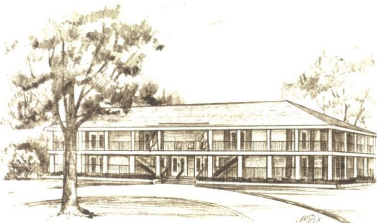
St. Elizabeth Ann Seton Shreveport, Louisiana