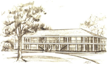
St. Elizabeth Ann Seton Shreveport, Louisiana