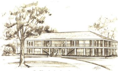
St. Elizabeth Ann Seton Shreveport, Louisiana