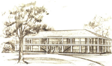
St. Elizabeth Ann Seton Shreveport, Louisiana